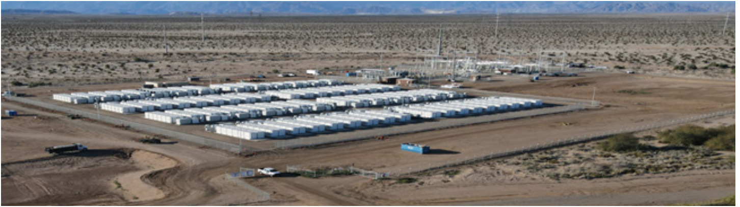
Battery storage facility